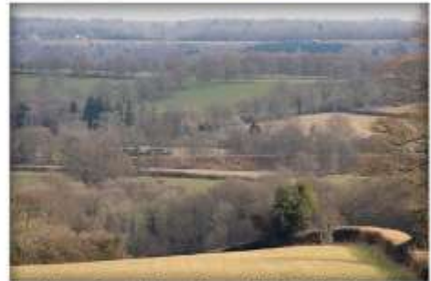
View South-East from All Saint's Church, Highbrook with Bluebell Railway