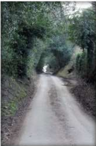
Green tunnel along Cob Lane